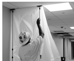
Worker establishing a containment area during an ICRA training class.

CPWR and NABTU, for example, have designed an 8-hour ICRA Awareness Training Program for construction workers.