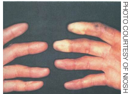
Hand Arm Vibration Syndrome